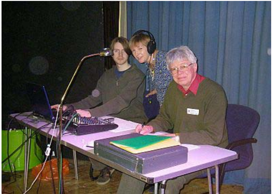
The Production Team

of the Irish Blessing will be pleased to know that this poignant song will also feature amongst the 18 songs on the CD, which will be available to purchase later this term.